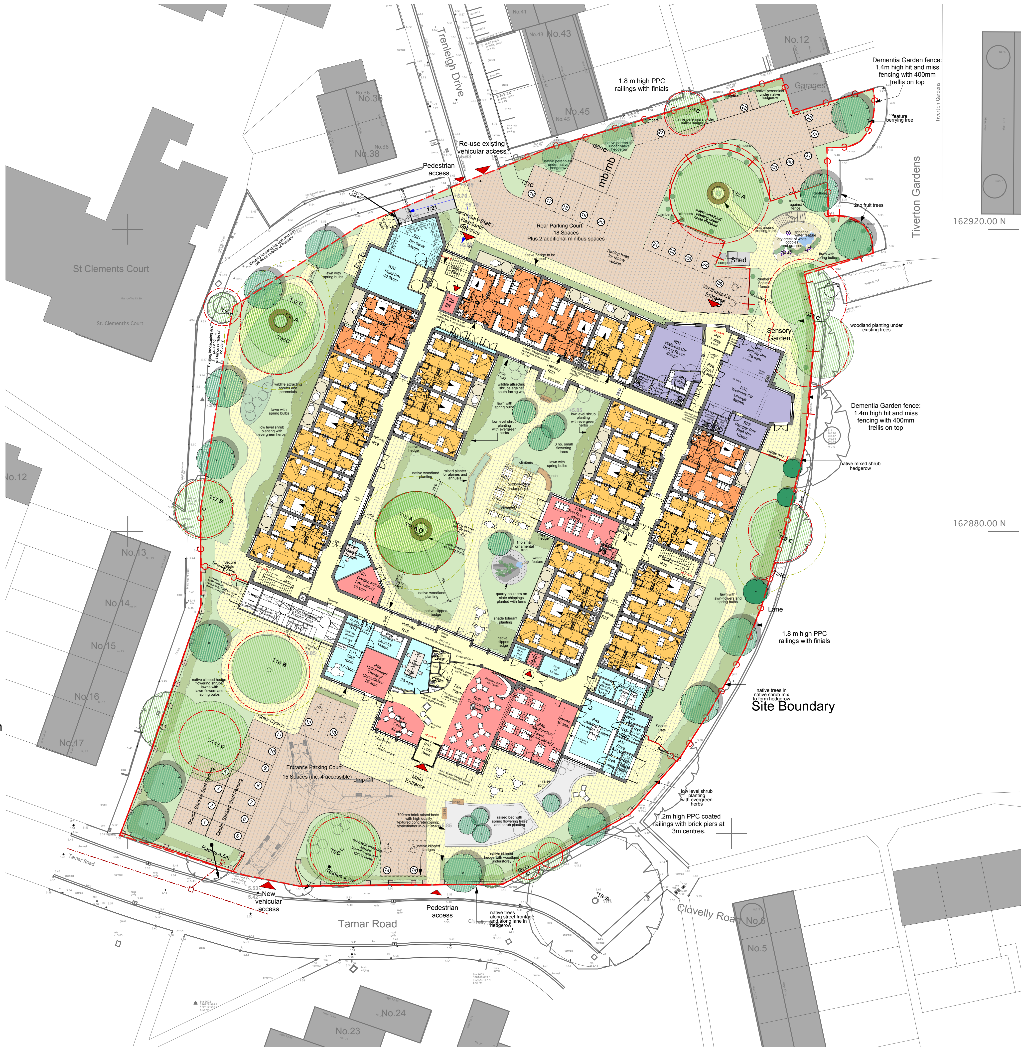
Site Plan with Ground Floor