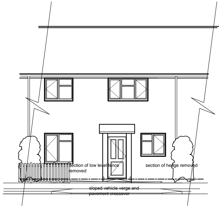
PROPOSED SOUTH ELEVATION Scale 1:100