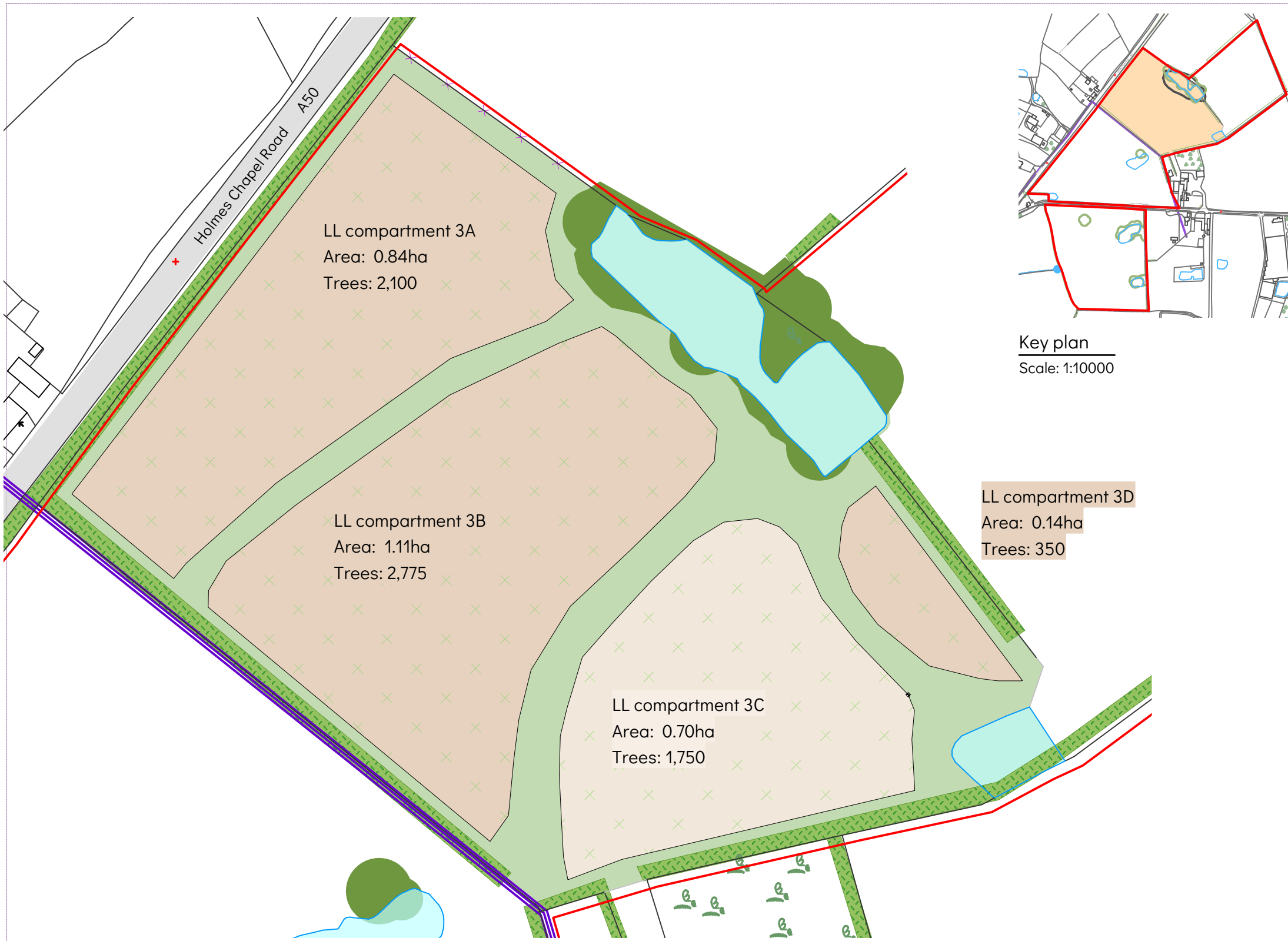
LL - Field 3 - Compartments Plan Scale: 1:1250