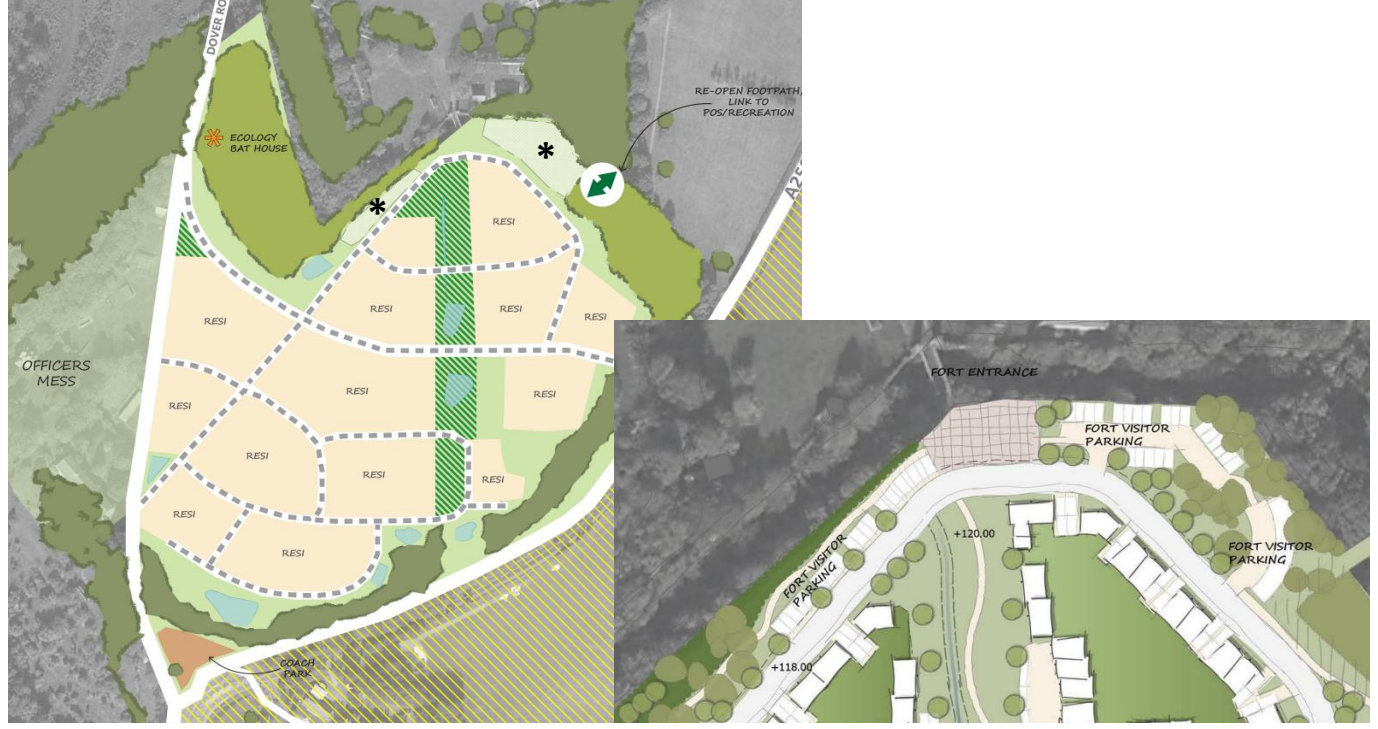
Figure 3: Extract of illustrative masterplan to show location of visitor car parking (* = car parking on parcel plan)