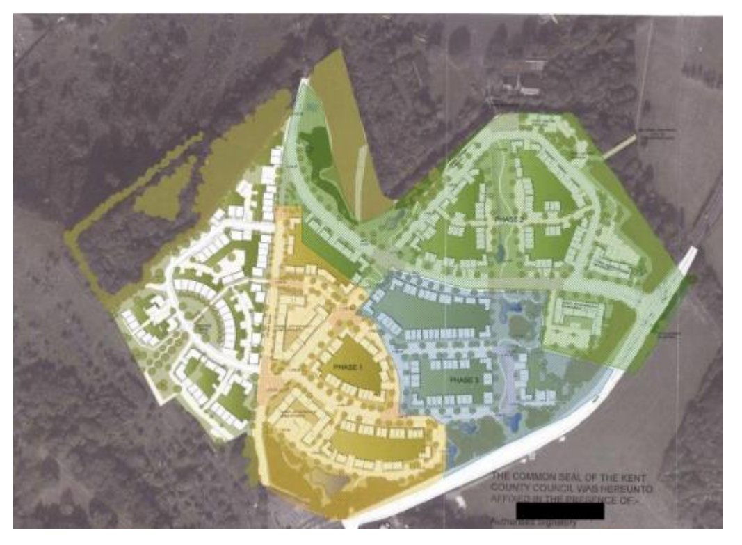
Figure 2: Illustrative Phasing Plan