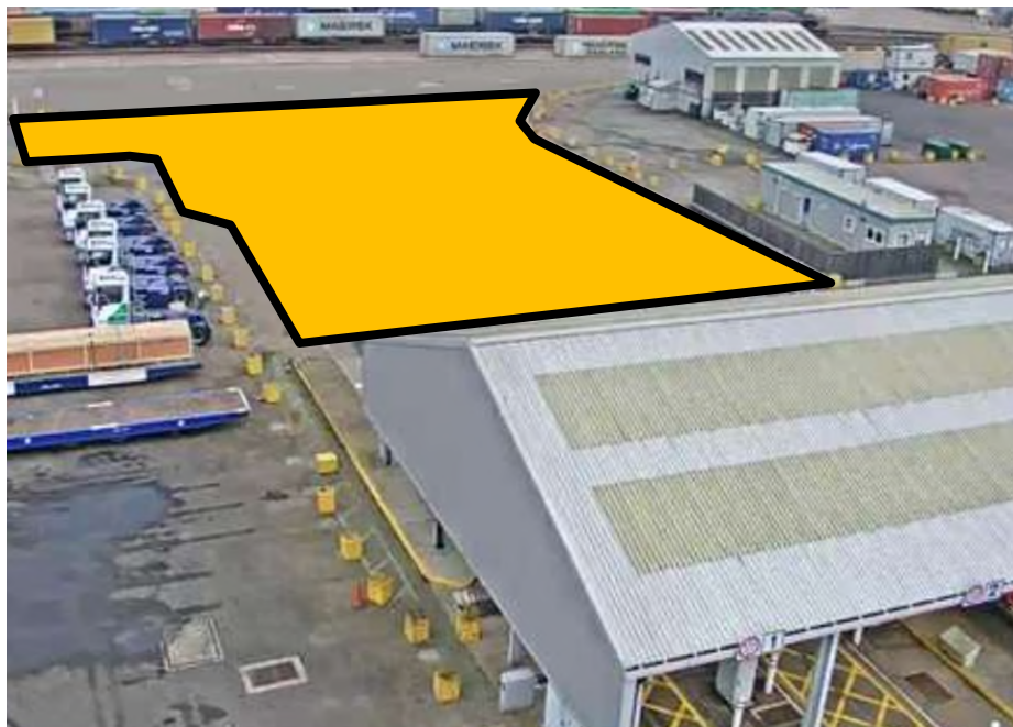
North Rail Gates