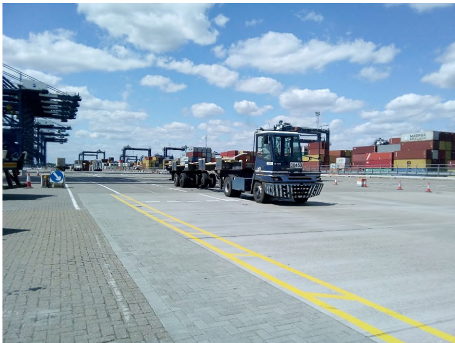
Concrete pavement installed in 2022 to replace block paving at Southern extent of Zone 7 Quayside Roadway

The works are to take place on the North Rail Gates, 850m 2 during 2024 and 850m 2 during 2025.