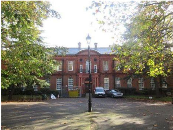
Bethnal Green Library