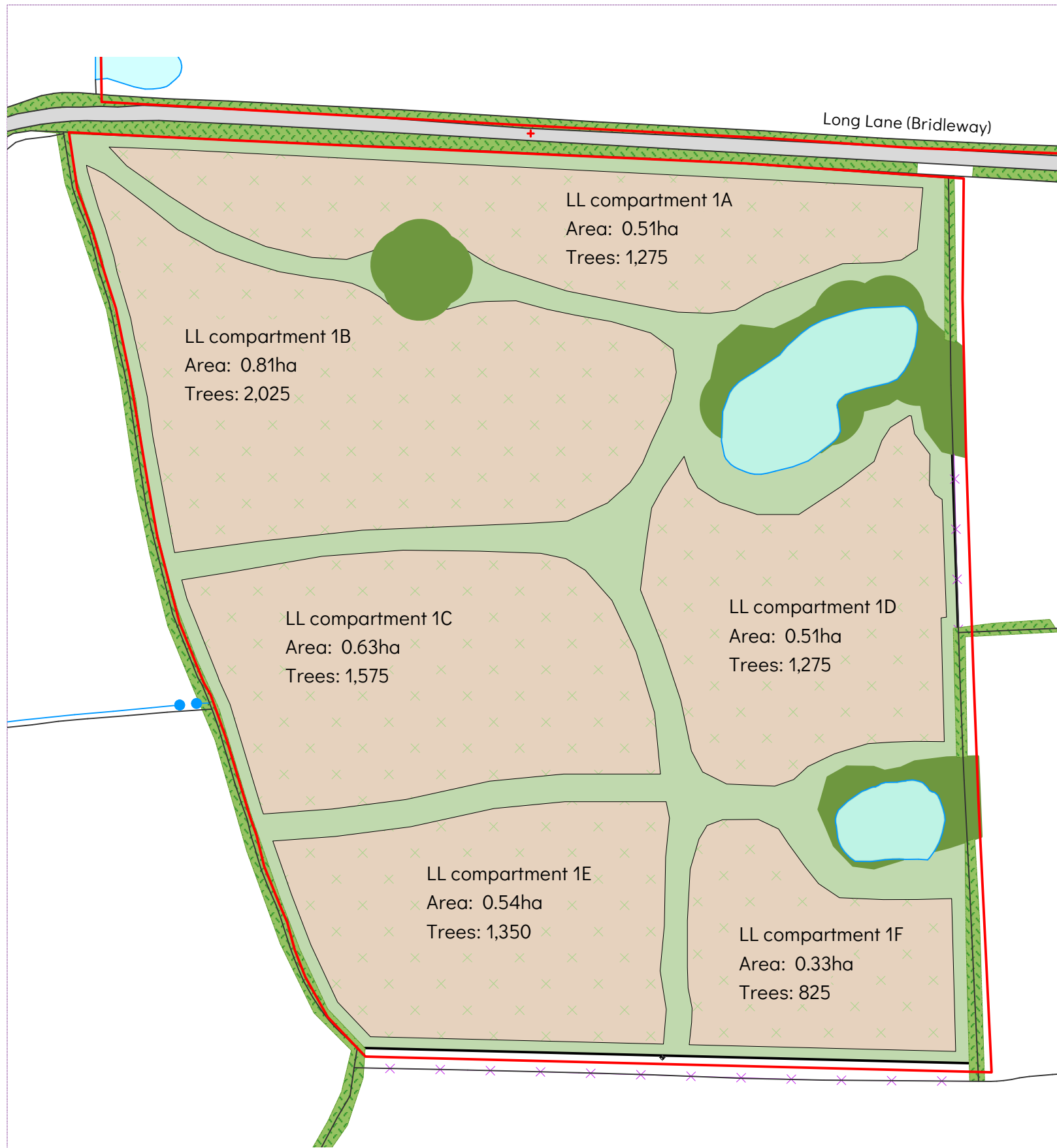
LL - Field 1 - Compartments Plan Scale: 1:1250