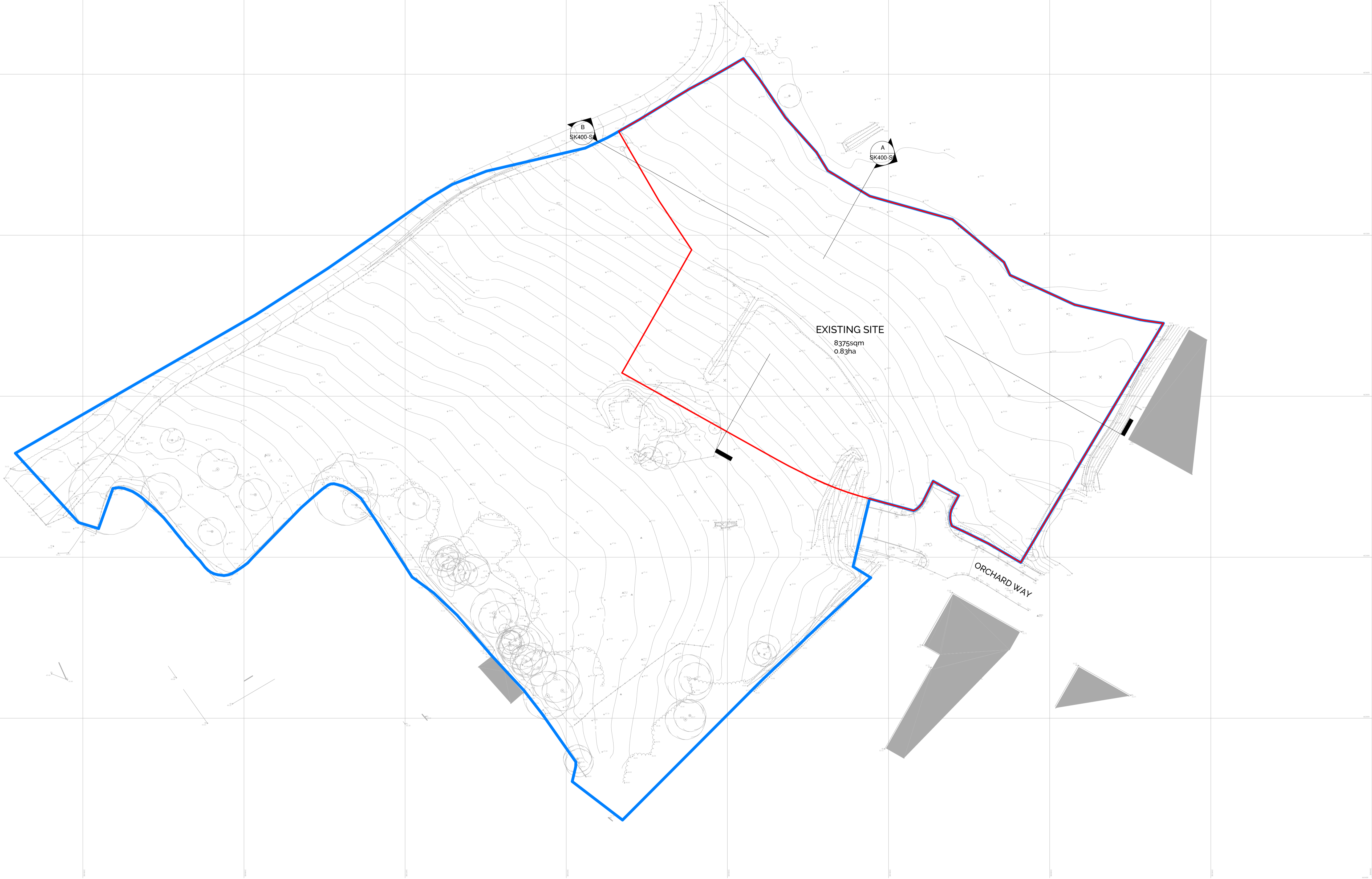
EXISTING SITE LAYOUT 1 : 500