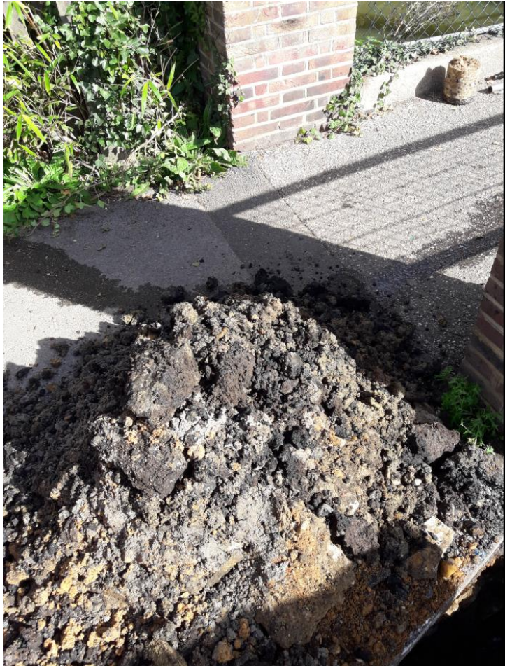
Photo 4 TP01 arisings