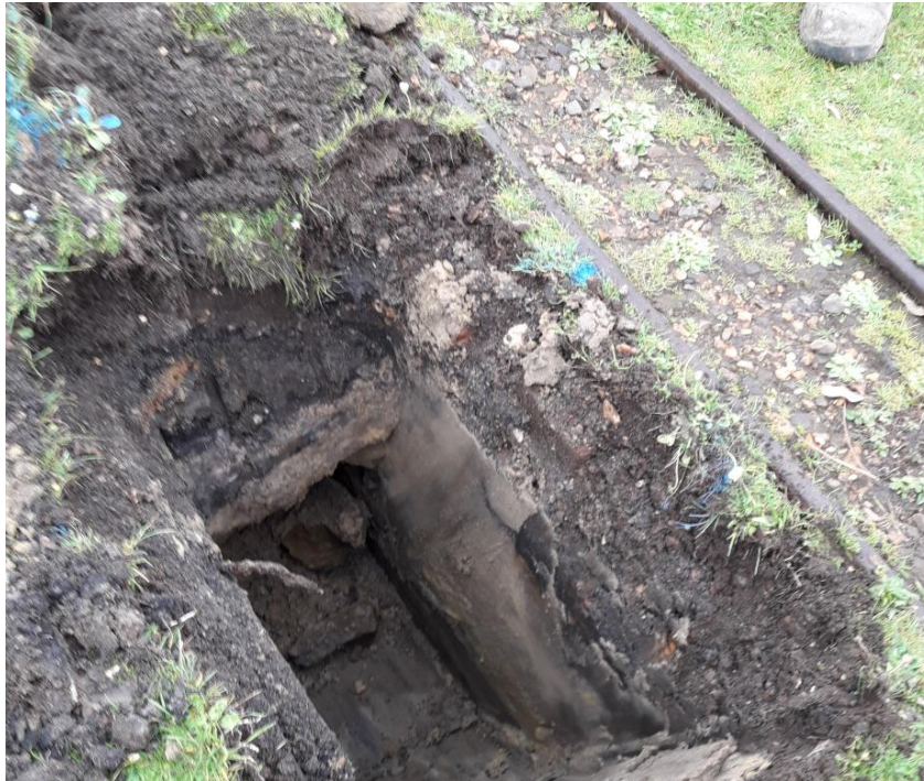
Photo 23: Alternate view of track bed and ground profile within TP09