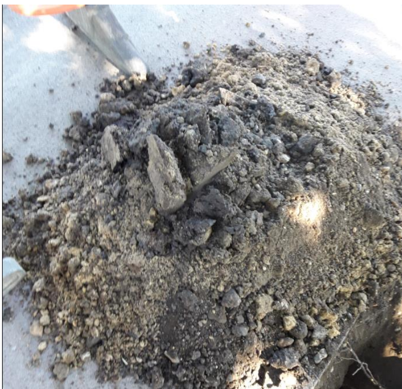
Photo19: Arisings from TP07