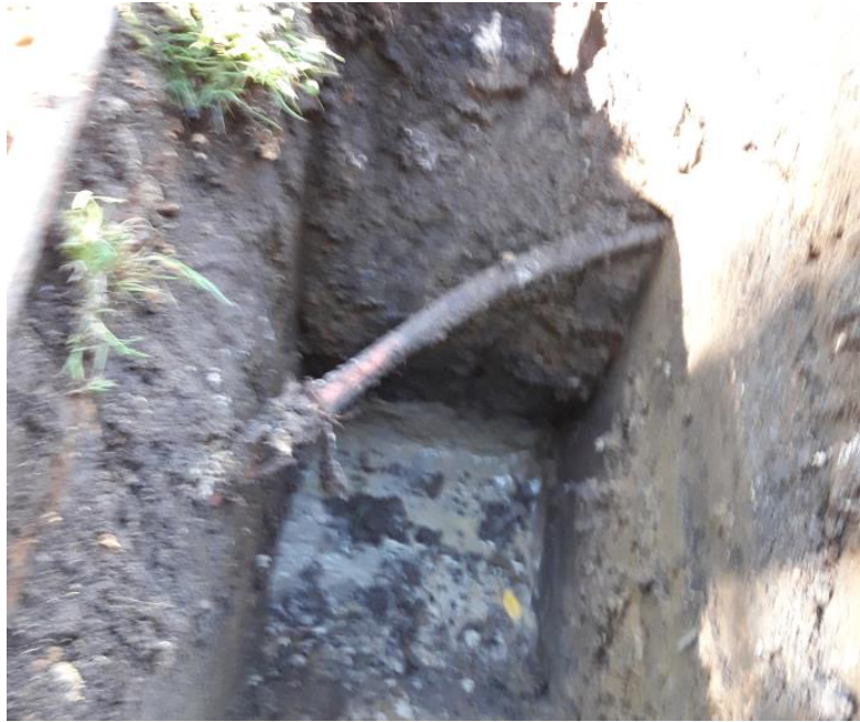
Photo13: Groundwater revealed within TP05