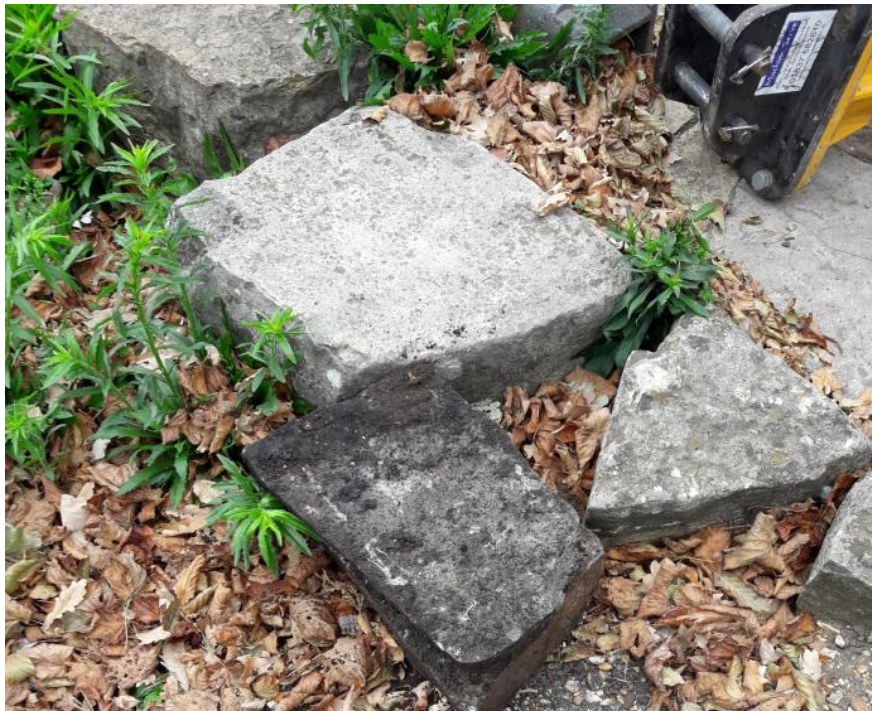
Photo33: Limestone boulder excavated from TP12