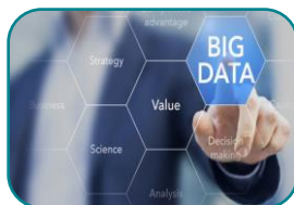
Harness the power of data