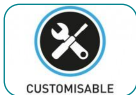
Benefit to customer