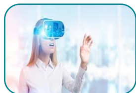
Game changer elements