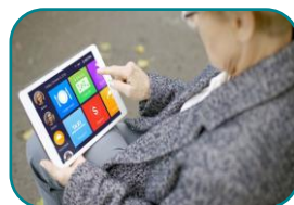
Independence through technology