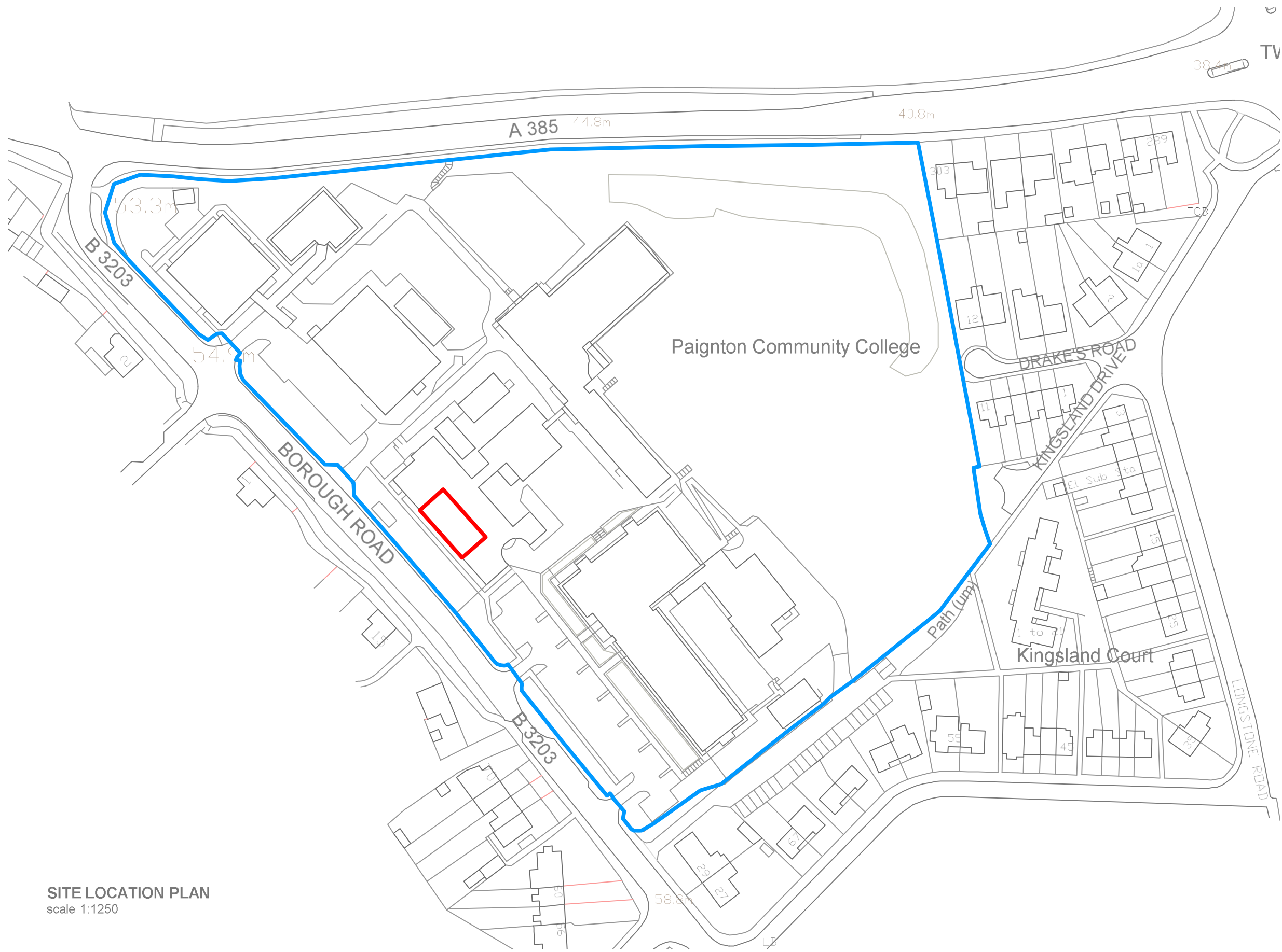
SITE LOCATION PLAN scale 1:1250