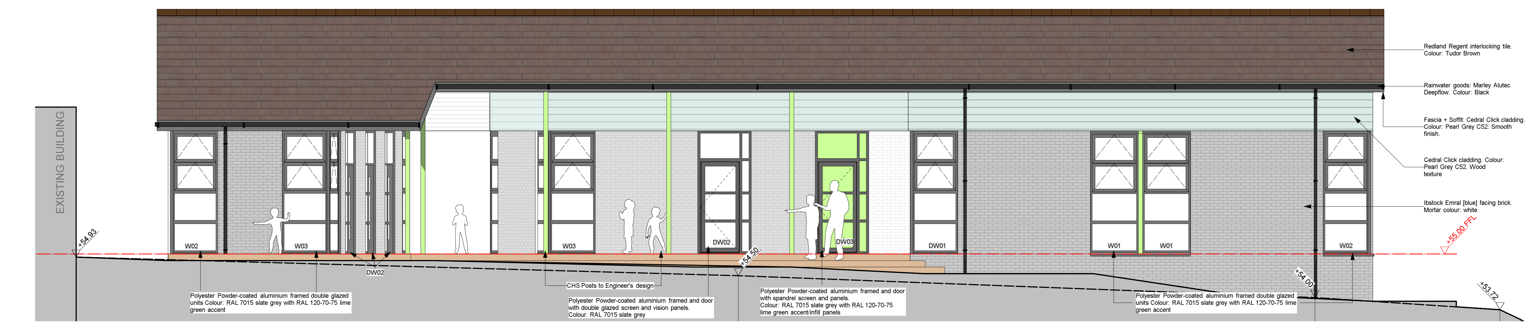
[SOUTH EAST ELEVATION] Scale: 1:50