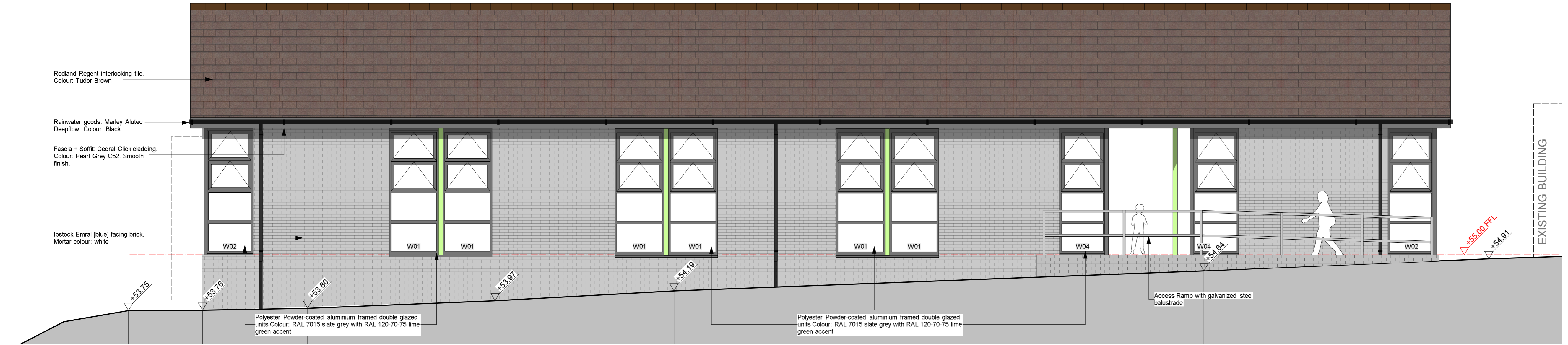
[NORTH WEST ELEVATION] Scale: 1:50