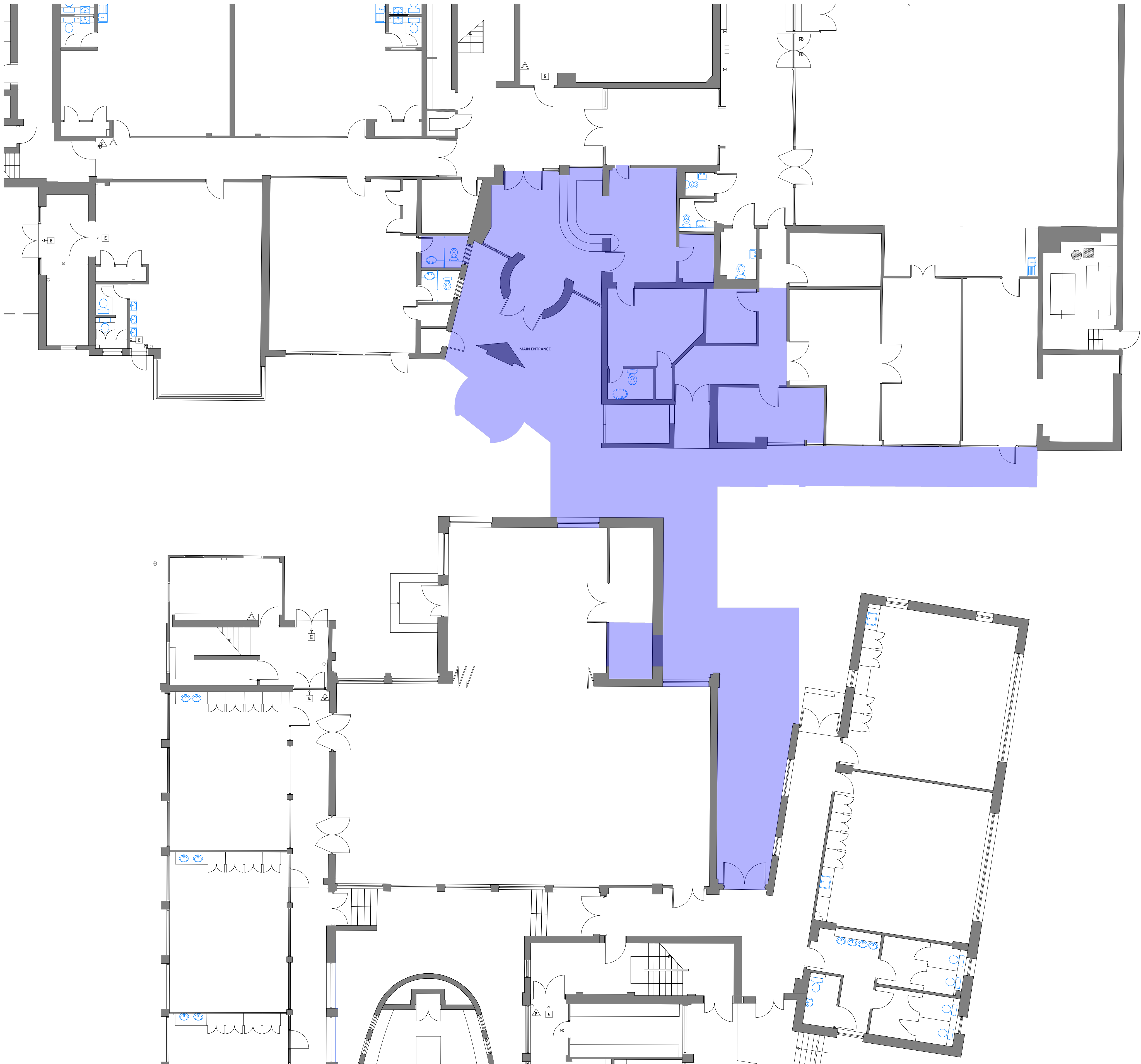
Existing Layout: Scale 1:100

This drawing is protected by copyright and must not be copied or reproduced without the written consent of Edge Property Solutions. No dimensions are to be scaled from this drawing. All dimensions and sizes are in millimetres unless otherwise stated and should be checked on site. No part of this publication may be produced, stored in any retrieval system or transmitted in any form or by any means without prior permission of Edge Property Solutions This drawing is to be read in conjunction with specification, structural engineer's and services consultant's specification. All building elements are to comply with current building regulations requirements. Refer to the pre construction information for the project for designers risk register and hazards associated with the project.