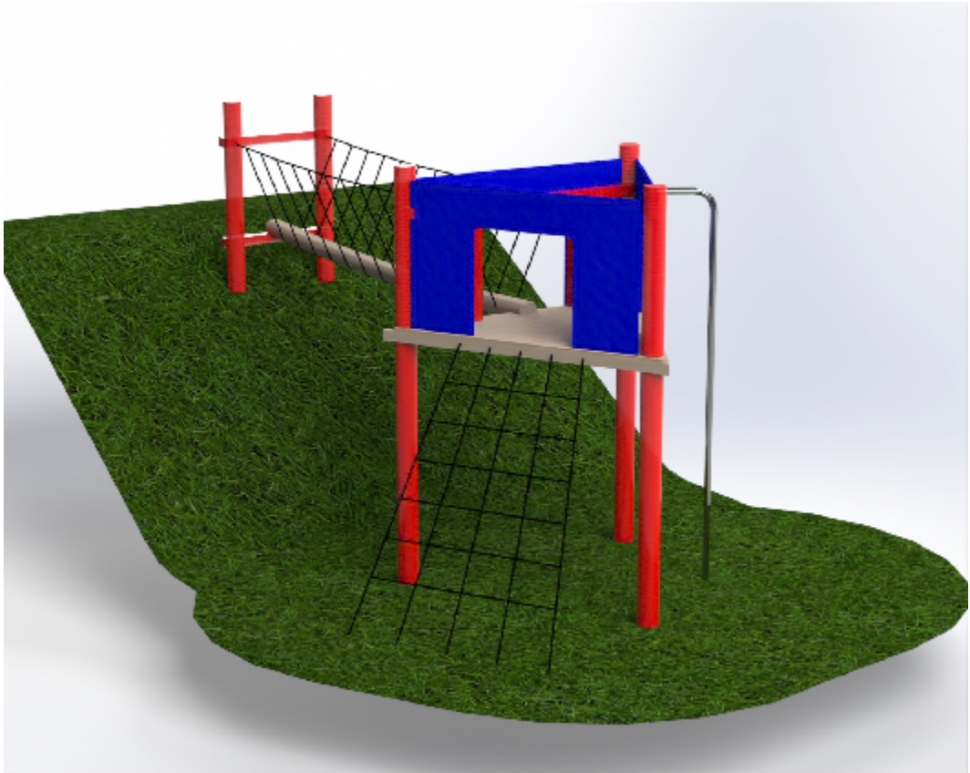
ROBINIA POLES TO BE PAINTED