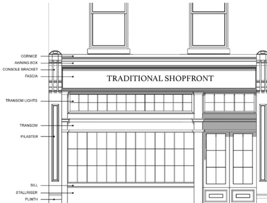
Figure 1 Key components of a traditional shopfront

The typical components of a modern shopfront are highlighted (fig.2) and a modern design approach will be appropriate where the setting or building suits this situation. Locations such as