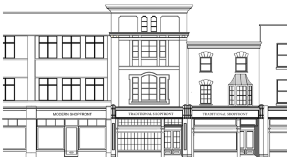
Figure 3 Shopfronts that relate well to the building façade and street

Over time, alterations to shopfronts can lead to a loss of unity in a building's appearance, which can result in a loss of harmony and/or cohesion across a group of buildings. When altering shopfronts, businesses and owners should aim to restore cohesion across architectural lines and design features. Efforts should be made to establish visual order across all stories of a building or facade, as opposed to focusing on the ground floor shopfront in isolation.