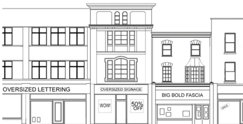
Figure 4 Shopfronts that have little or no cohesion with inappropriate alterations

Where opportunities exist to improve unity across a façade or group of buildings, North Somerset Council will work with business and property owners to ensure consistency in design as part of the planning process. Where site wide improvements are required, for instance in a conservation area, the council may use planning conditions to secure improvements to the development.