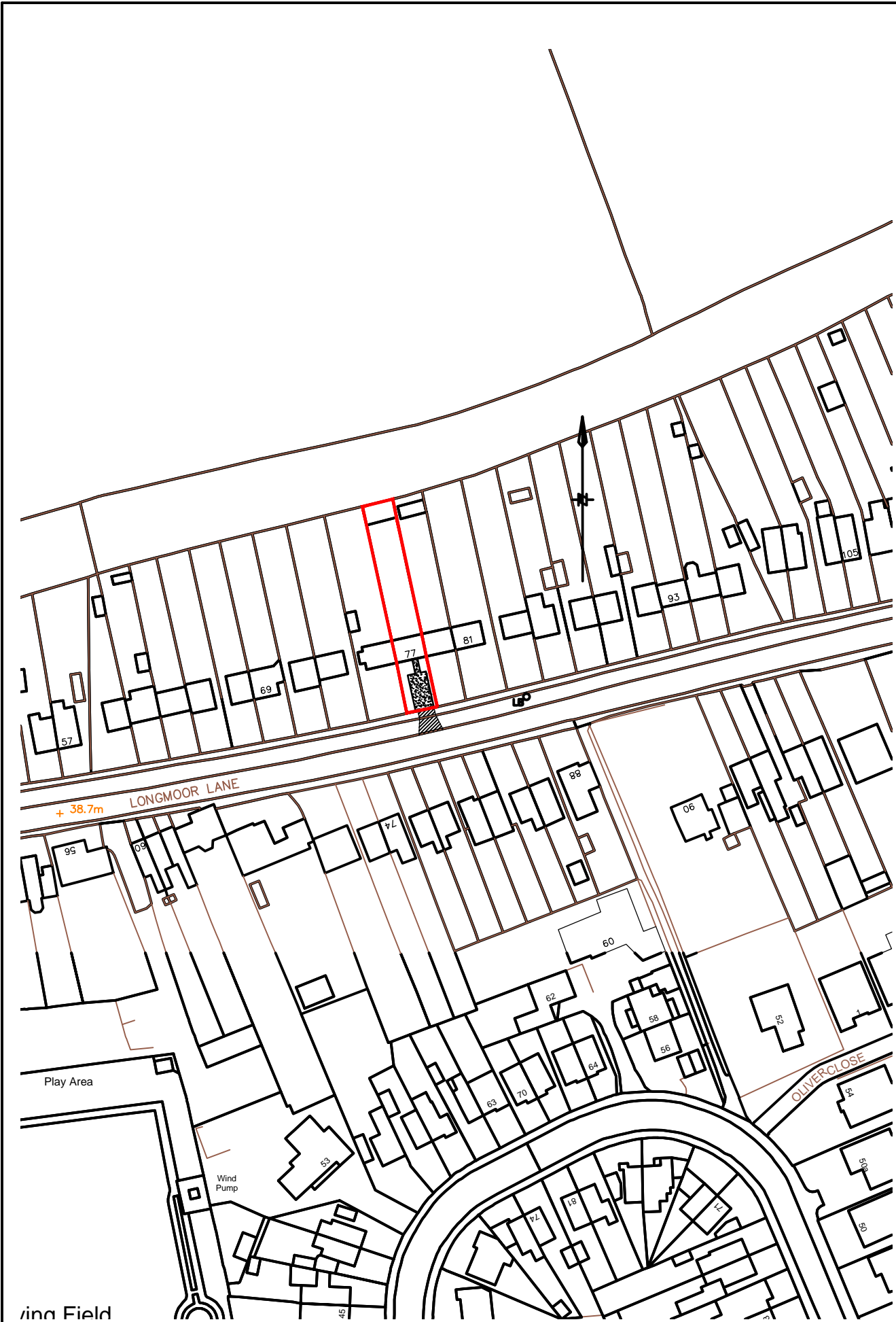
Proposed Location Plan Scale 1:1250