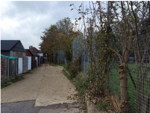
2 posts may require replacement – self set trees and shrubs to be removed.