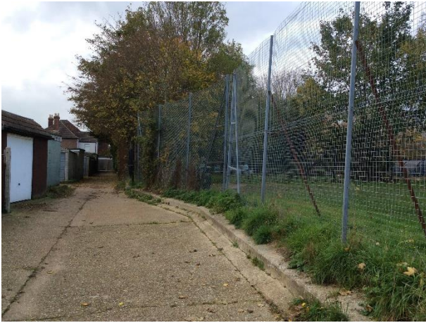
End section – loose posts x 2 the corner post is sound – self set trees and shrubs to be removed.