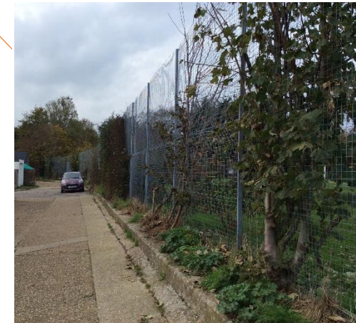
1 post may require replacement – self set trees and shrubs to be removed.