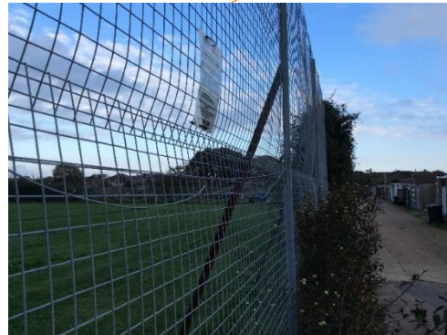
At least one post to be replaced – self set trees and shrubs to be removed.