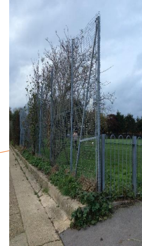
2 end posts to be replaced – Self set trees and shrubs to be removed.