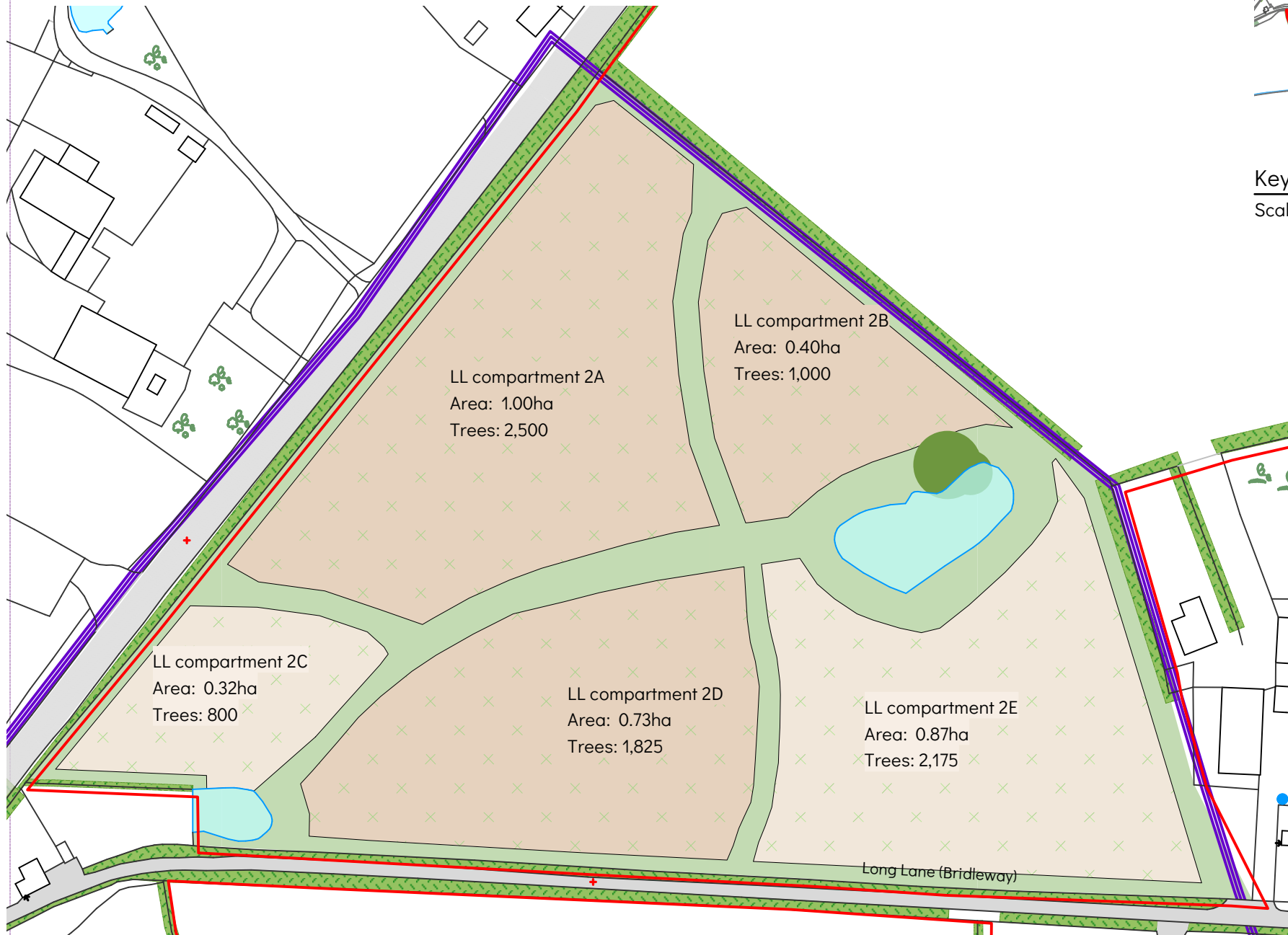
LL - Field 2 - Compartments Plan Scale: 1:1500